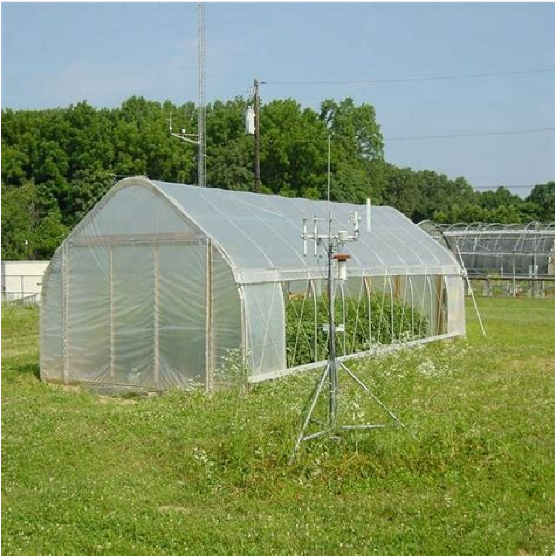
Greenhouse plastic sheeting menards